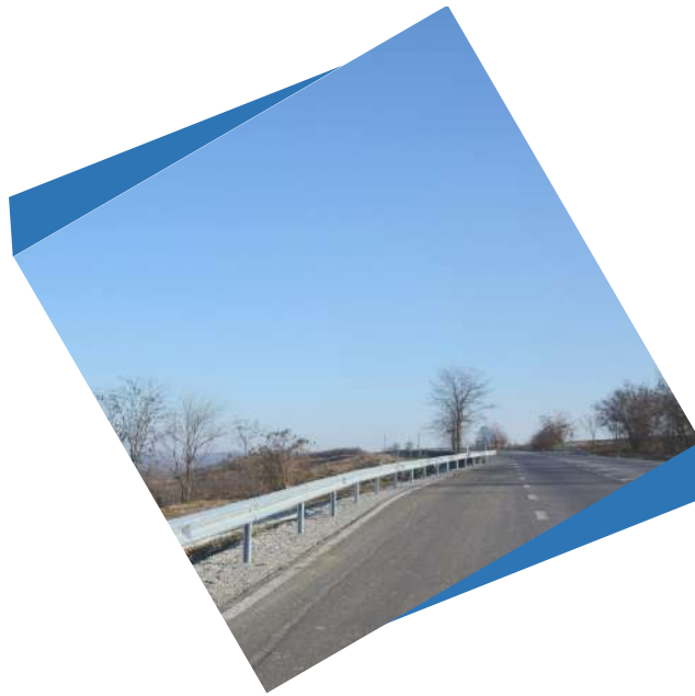
2018 3.2 m Euro from KIDSF for the construction of 11.2 km ring road of Kozloduy