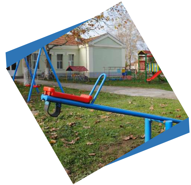
2009-2014 2.5 m Euro from KIDSF by SE RAW