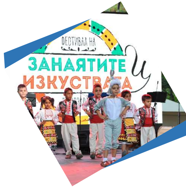
2012-2020 1.2 m Euro in support of projects of social importance